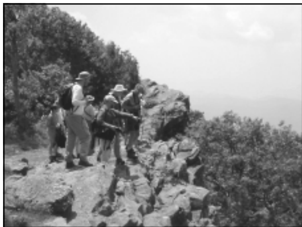
A group of VNPS hikers views a rare rocky outcrop plant community at Hawksbill Gap in the Shenandoah National Park.

Virginia Natural Heritage Program (VANHP) biologists conducted surveys in 2005 and 2006 of 50 rock outcrop sites in the park. Eleven vegetation community types were documented, nine of which were found to be globally rare. An even more significant discovery was that two communities are entirely endemic to SNP. The High Elevation Greenstone Barren plant community occurs on fewer (See High elevation habitats, page 4)